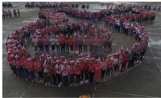
PINK Ribon Human Formation